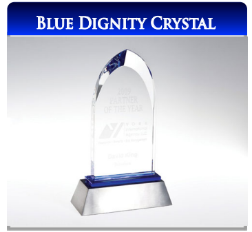
Item # C1013 size 9-3/4"H X 6"W Etch Area: 7.3"H X 4.1"W