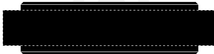
Standard Etch: Front