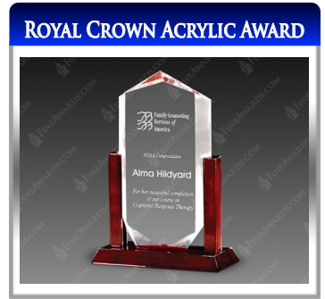
Item # RCA9 Size: 9"H X 6.75"W X 3.125"D Etch Area: 3.3"W x 5.2"H