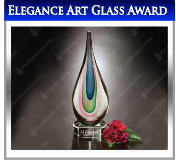
Item # 7230 Size: 9"H X 4"D Etch Area: 2.5"W X 1.1"H