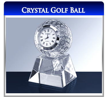
Item # CLKGF60 Size: 3.75"H X 2.25"W X 2.25"D Etch Area: 1.9"H X 1.9" W

For more info see art guidelines at www.fineawards.com/Artwork-info/html