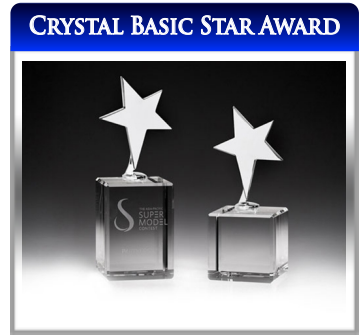
Item # EC840L Size: 2-3/4"W X 2-3/4"D X 8-1/4"H Etch Area: 2 "W x 3.2 "H