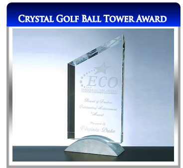
Item # CM06 Size: 10"H X 10"H X 5"W X 2.5"D Etch Area: 4"W x 8"H