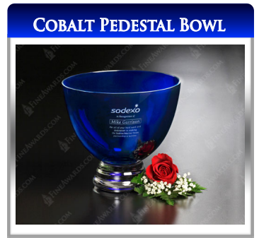
Item # 2245 Size: 7.5" X 8.5" Etch Area: 2.5"W x 2.5"H