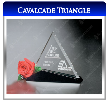
Item # 6325 Size: 6"H X 6.75"W X 1.5"D Etch Area: 4.2"W x 3.9"H