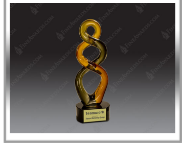
Item # AGS21 Size: 13.5"H X 3.13"W X 4.5"L Etch Area: 2.75"W x 1.3"H