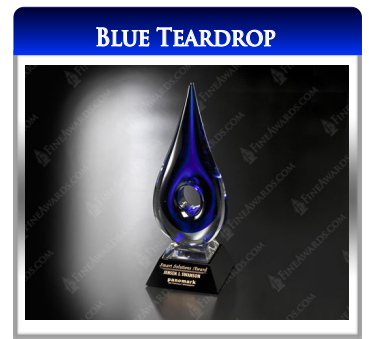
Item # 7261 Size: 14"H X 5.25"W X 2.75"D Etch Area: 3.83"W x 0.93"H