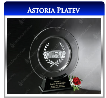
ASTORIA PLATEV Item # 6297 Size: 15.5"H X 14"W Etch Area: 8.5"H X 8.5"W