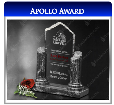
Item # 3330 Size: 8.75"H X 7.75"W X 2.75"DIA Etch Area: 6.4"H X 2.9"W