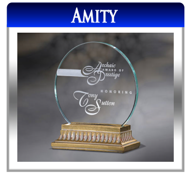
Item # FR7304-6-J(COLOR: GOLD) Size:6"W X 6.75"H X 3"D Etch Area: 5.4"W x 5.8"H