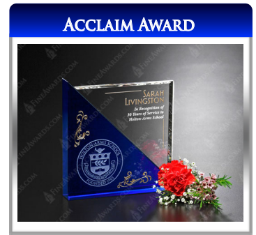
Item # 6790 Size: 5"H X 5"W X 1.25"D Etch Area: 3.7"W x 3.7"H

For more info see art guidelines at www.fineawards.com/Artwork-info/html