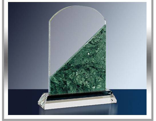
ITEM # 267A1 SIZE 7"H X 5"W X .5"D