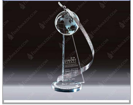
ITEM # 2029 SIZE 11"H X 4.5"W X .5"D